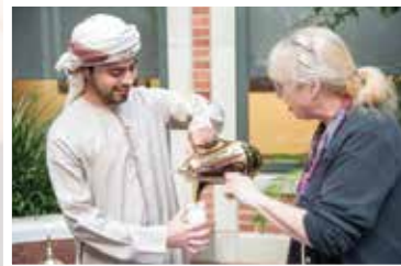
Hospitality & Leisure