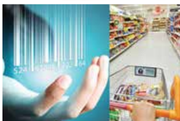
Retail & Consumer